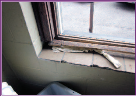
Due to the use of a window air conditioner, the sill of this window in the kitchen is gone.