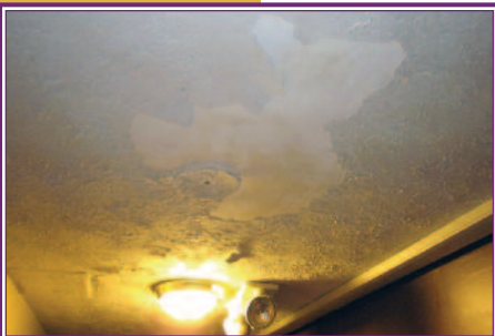
There are numerous areas around the house where the ceiling texture is peeling.