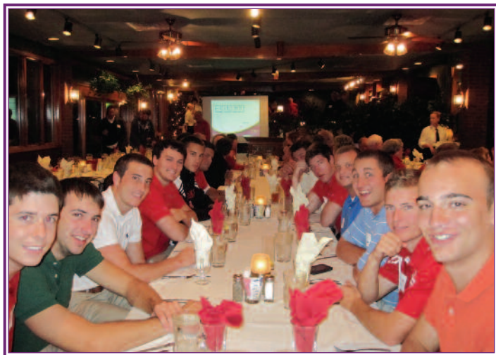
Undergraduates enjoy the alumni reunion at Knolls Country Club.

Beta Tau has the honor of hosting the 2012 Western Plains Division