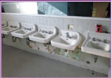
The plumbing for the sinks of the freshman bathroom has been a constant issue, and after years of use, a majority of the wall tile is missing under the sinks.