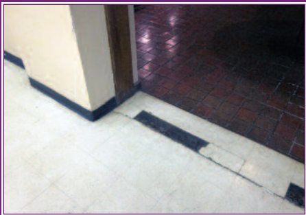
Dilapidated flooring can be seen in rooms throughout the Shelter. Help us update features like this by sending in a pledge today.