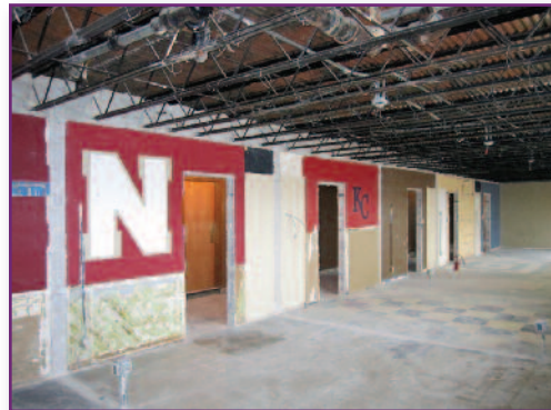
All of the walls and ceilings in Sophomore Hall have been removed to make room for new suite-style units, fire sprinklers, and central heat and air conditioning.