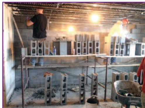
Masonry work progresses on the third floor for the suite-styled rooms. Many projects remain and your gift will help to see this renovation through to the end.