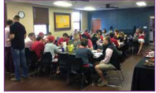
No tailgate would be complete without great food! Parents and brothers enjoy a delicious lunch during the fall tailgating event.

fraternity on campus and the top chapter in Delta Tau Delta.