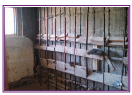
The freshman bathroom has been gutted in preparation for renovations.