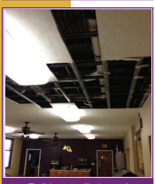
The dining room ceiling is exposed to make room for new plumbing, electrical, and fire-safety systems.