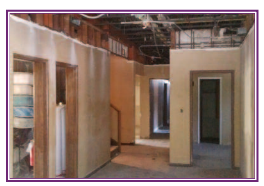
View from the front foyer looking toward the president's room.

Tau Chapter. Commitments are still needed from our alumni to achieve our goal and complete this major project. If an error has been made in recording your gift, we sincerely apologize. Please contact our campaign coordinator with corrections at (785) 843-1661.