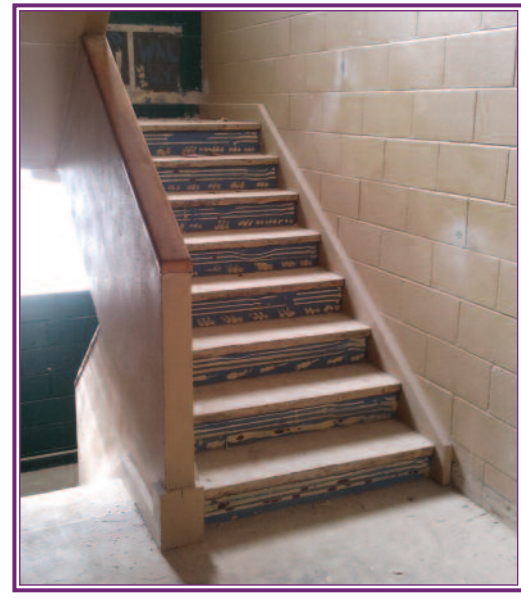
The stairwells on the west side of the house will receive new rubber stair treads and risers, new handrails, and the walls and ceilings will be repainted.