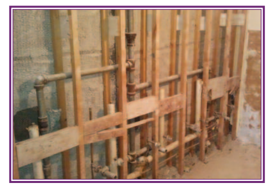
New sink fixtures, flooring, wall finishes, toilet partitions, and showers will be installed in the second-floor bathroom. After uncovering all of the plumbing, we found some pipes that have been leaking for years which will now be repaired.