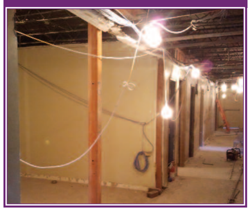
Two walls were removed to make an open group study area in the freshman hall study space.