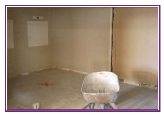
The vending area adjacent to the kitchen will become two public ADA restrooms.