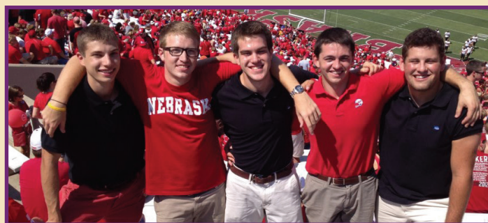
Undergraduates bond at a football game at Memorial Stadium.