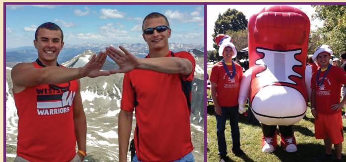
Brothers visit the Rocky Mountains during the summer.