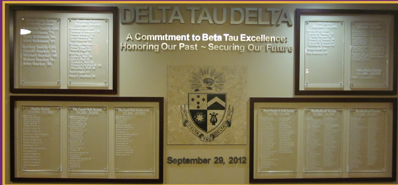
Thank you for helping us reach our goal! All donors who contributed $1,000 or more to the A Commitment to Beta Tau Excellence: Honoring Our Past ~ Securing Our Future campaign are featured on the donor wall, prominently displayed in the basement library of the Shelter.