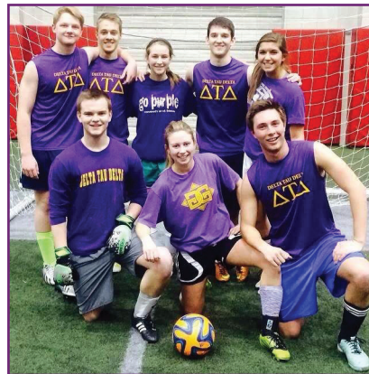
The Delta Tau Delta intramural soccer team celebrates after a winning match.

We are also working on setting up an incoming male scholarship for high school students planning on attending UNL. By offering this scholarship to all incoming males, we hope to spark an interest in some guys who may not have known what Greek life was until applying for our scholarship. Setting a high school GPA requirement for application, we hope to obtain a strong group of guys to get to know more about Delt before they are exposed to any other fraternities in the summer. We are recruiting eight spring pledges as of now, and we