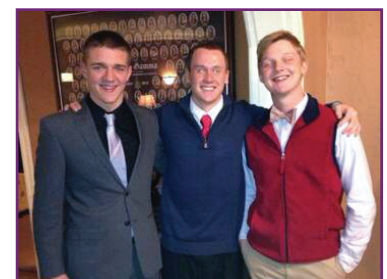
Delt brothers at a chapter event.