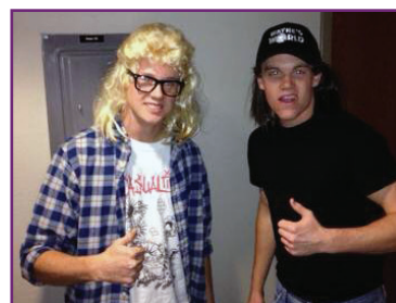
Members dress up in their best Wayne's World costumes.